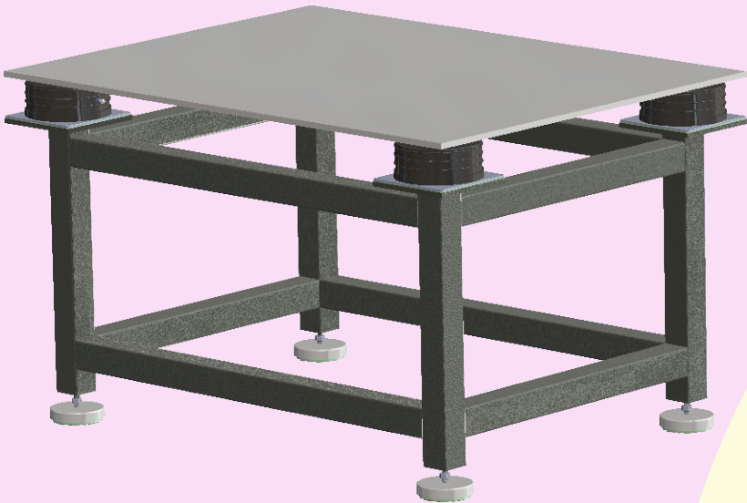
Before Installing of Dynemech Antivibration Table