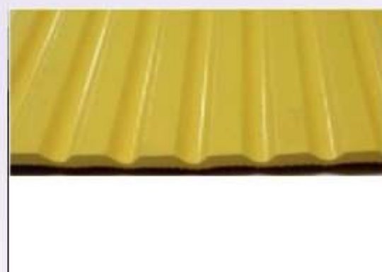
DBR Broad Rib Mat