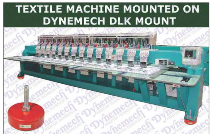
Fig 1: Textile Machine on Dynemech DLK Mounts